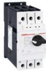
Motor protection circuit breaker SM2R